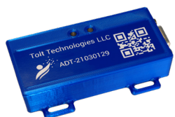
Ability Drive® hardware